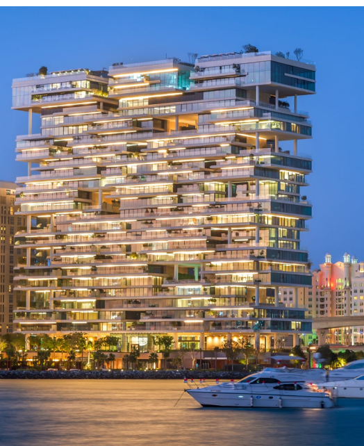
ONE AT PALM JUMEIRAH, DORCHESTER COLLECTION, DUBAI

OMNIYAT's impressive portfolio, with a combined gross realisation of over AED 17 billion, includes stars such as The Opus by OMNIYAT, One at Palm Jumeirah, Dorchester Collection, Dubai and The Residences, Dorchester Collection, Dubai.