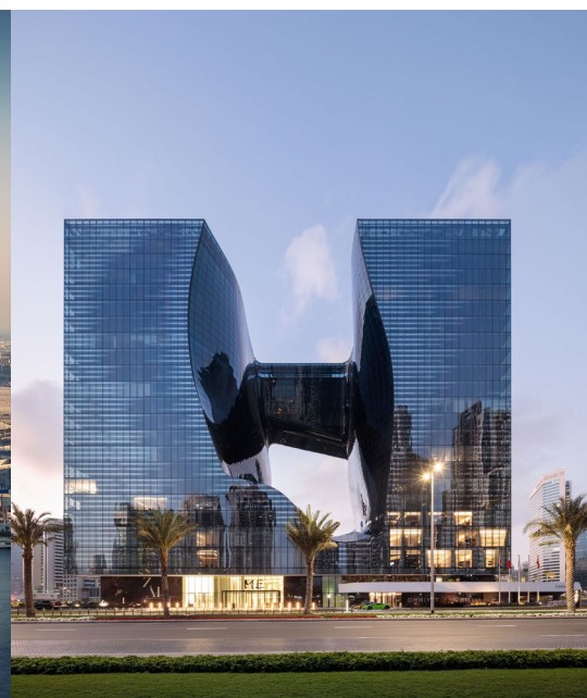
THE OPUS BY OMNIYAT, DESIGNED BY ZAHA HADID