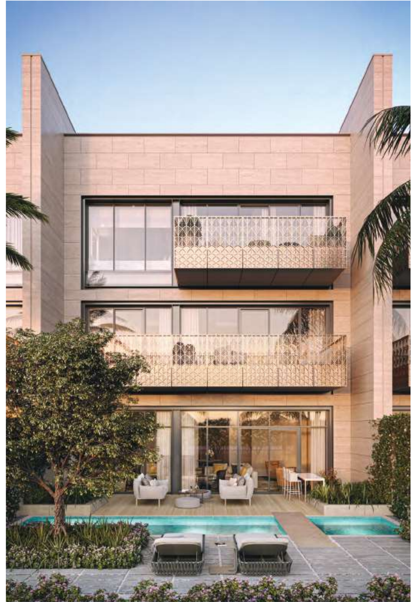
GARDEN TERRACE AND POOL

The grand-scaled living and dining rooms open onto the lushly landscaped pool and garden oasis making these amongst the most desirable private entertaining spaces in Dubai. On the upper bedroom levels, expansive balconies offer private havens overlooking the Water Canal and downtown skyline.